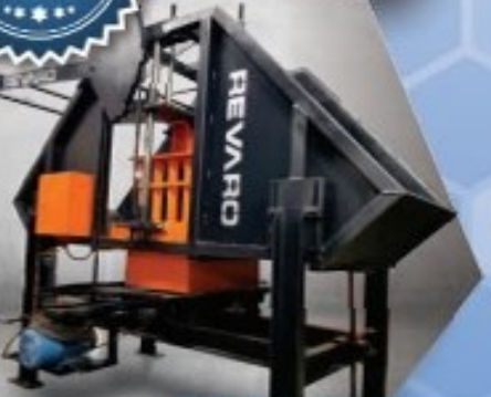
RE4-16 STATIC MANUAL