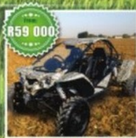
200-1500cc SIDE BY SIDES