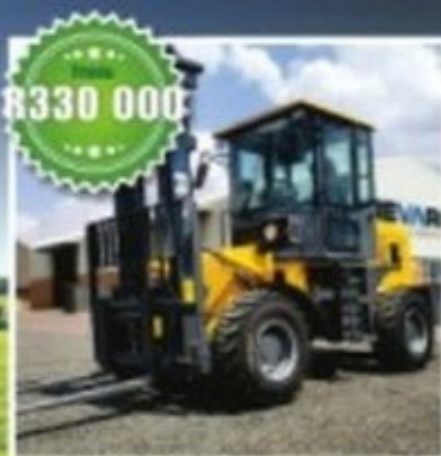
3TON ROUGH TERRAIN FORKLIFTS