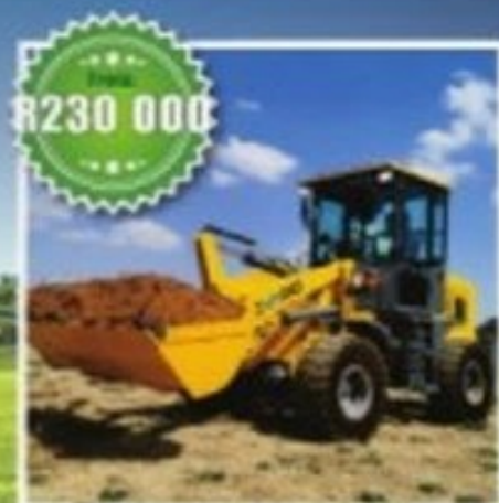
1.2-5TON FRONT END LOADERS

Agri-related product dealers who are looking at expanding their product offering, are welcome to enquire about becoming a Revaro Agent.